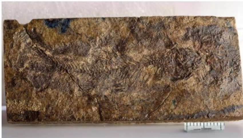
Photograph of Acronichthys maccagnoi fossil (with scale), which was located well inland from the shoreline of the Western Interior Seaway.

To read the entire article about Acronichthys maccognoi : Hidden for 70 million years, a tiny fossil fish is rewriting freshwater evolution | ScienceDaily