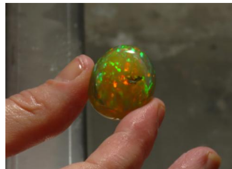
Amazing Opal (worth a double take!)