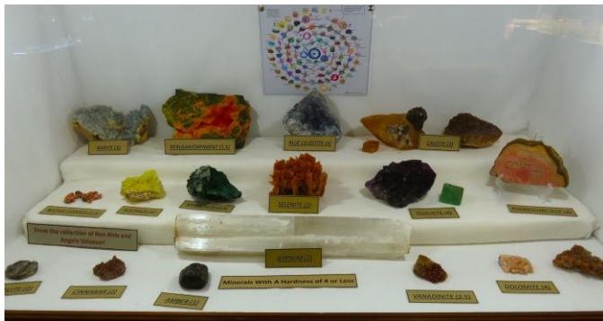
Ron's Display Case