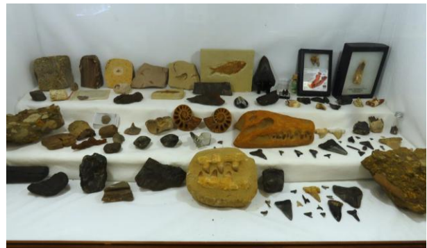
Madline's Display Case